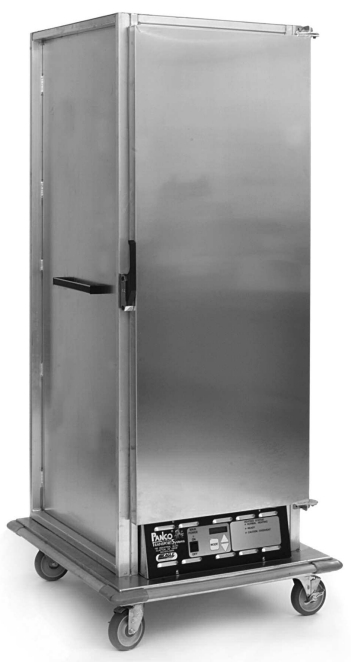
full size non-insulated heated/proofing cabinet with solid door

Aluminum interior and exterior, patented TEMP-GARD<sup>®</sup> air flow design, (insulated/non-insulated), bottom mount control panel and heating system, door (solid, or with polycarbonate window), adjustable digital temperature control system with LCD readout, and adjustable humidity control. High temperature protection with alarm and auto reset. Removable (wire/universal wire) slides on 2<sup>1</sup>/<sub>4</sub><sup>"</sup> standard spacing, full perimeter bumper, 8<sup>'</sup> cord and plug, and 5<sup>"</sup>-diameter heavy duty polymer swivel casters, two with brakes.