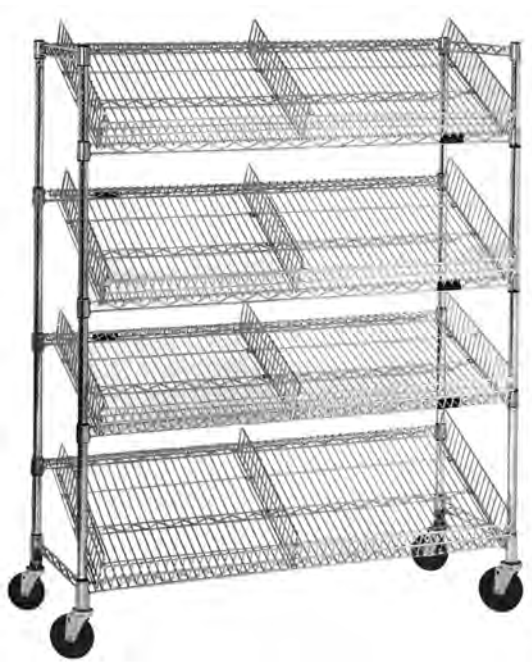
angled shelf/visual merchandising cart shown with optional additional dividers

Eagle Angle Shelf/Visual Merchandising Cart, model ____. (EAGLEbrite<sup>®</sup> Zinc, Chrome, Black Epoxy, Valu-Master® Gray Epoxy, Valu-Gard® Green Epoxy) reverse mat angled wire shelves with hangar rails. 3-sided truss assembly at top and bottom for increased strength. (EAGLEbrite<sup>®</sup> Zinc, Chrome plated) posts with 5"-diameter resilient wheel casters.