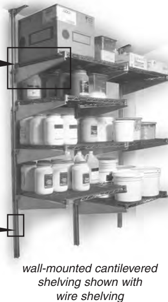
wall-mounted cantilevered shelving shown with wire shelving