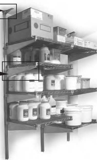
wall-mounted cantilevered shelving shown with wire shelving