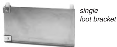
single foot bracket