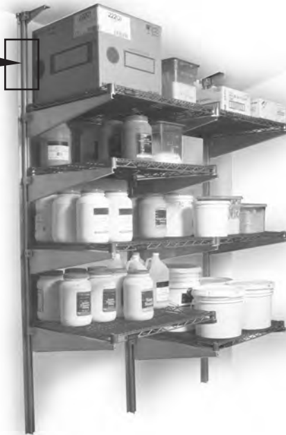
wall-mounted cantilevered shelving shown with wire shelving