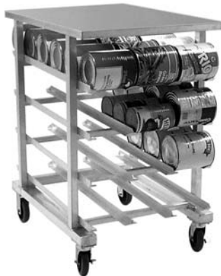
model #OCR-10-4A can rack with aluminum top

Eagle Panco® Half Size Mobile Can Rack, with 1/2"-thick polymer top, model _____. All-welded aluminum construction crossbraced front-to-back and side-to-side. Aluminum angle racks secured to frame at a slight angle to allow for gravity feed. Furnished with 4"-diameter casters. Capacity to be (54, 72) #10 cans or (72, 96) #5 cans.