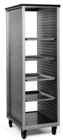
heavy duty rack with side panels

Eagle Panco Aluminum Rack with Side Panels, heavy duty model OR-1840. Constructed of 1" square tubular frame and support with 0.100"-thick aluminum die-formed top and bottom, with vinyl bumper around the top. Extruded aluminum corner posts riveted to top and bottom. \%"-diameter reinforcing rods. 1\%" slide spacing to accommodate (40) 18" x 26" full size sheet pans. Furnished with 5"-diameter casters. Unit shipped assembled.