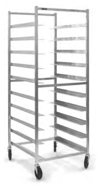
model #OTR-2810-A/W oval tray rack