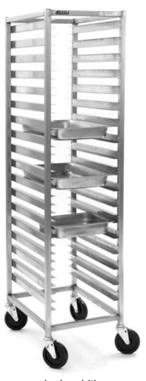
single-width stainless steel rack