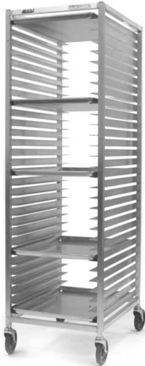
all-welded unit #OUR-1830-2/W

Constructed of 1" square tubular aluminum frame and supports. 1 1/2" x 1 1/2" extruded aluminum tray slides with two raised beads to minimize friction. Slides are welded to vertical posts. Slide spacing to be 2" to accommodate 30 full size sheet pans. Furnished with 5"-diameter casters. Front-loading and side-loading models available. Shipped assembled. 69 1/4" height and features open top.