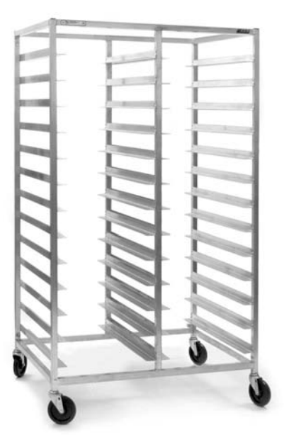
double-compartment rack model #OUR-1836-3

Eagle Panco® Double-Compartment Rack, stainless steel model _____. Constructed of all-welded heavy gauge stainless steel tubing. Tray slides to be 16 gauge stainless steel angle 1½" x 1¾" with raised bead edge. Slide assembly removable without the use of tools. Slide spacing is 5", 3", 24" to accommodate (22, 36, or 48) 18" x 26" sheet pans. Furnished with 5"-diameter casters. Shipped assembled.