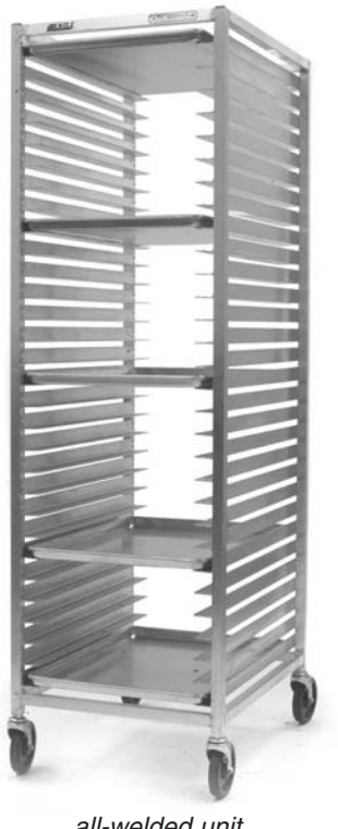
all-welded unit #OUR-1830-2/W