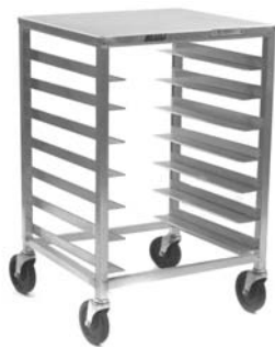
pizza dough box rack

Eagle Panco® Pizza Dough Box Rack, model OUR-DB-7A. All-welded aluminum construction with 1" square tubular frame and supports. Crossbracing runs side-to-side and front-to-back on top and bottom. 1 1/16" x 1 1/8" extruded aluminum slides with two raised beads to minimize friction. 3 1/2" slide spacing accommodates seven 18" x 26" pizza dough boxes. Furnished with 5"-diameter casters. Shipped assembled.