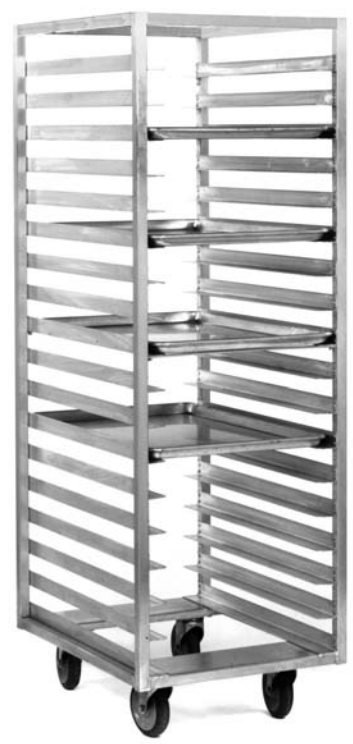
roll-in refrigerator rack

Eagle Panco® Roll-In Refrigerator Rack, stainless steel model _______. Frame, cross supports, top and bottom constructed of 1" square stainless steel tubing. Bottom is 14/304 die-formed stainless steel dolly frame. 1\%" x 1\%" extruded aluminum tray slides with raised beads to minimize friction. Slide spacing to be 2\%", 3", or 5" to accommodate (24, 18, 11, or 36) trays. Furnished with 5"-diameter casters. Shipped assembled. Note: Model #UARR-64-SR comes with 11 universal angle slides, each holding two 12" x 20" pans.