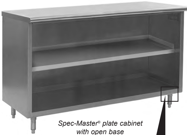
Spec-Master® plate cabinet with open base

Eagle Spec-Master® Plate Cabinet, model _____. Top is 14 gauge type 304 stainless steel—with ends and rear turned down 90° and rolled rim on front—reinforced with full-length stainless steel hat channel. Full-length fixed center shelf and body are heavy gauge type 430 stainless steel. 1½" O.D. type 304 stainless steel tubular legs with 1" adjustable bullet feet. Available with open front, sliding doors, or hinged doors.