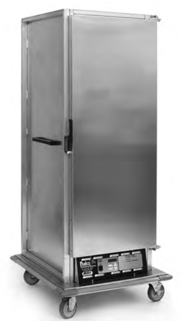
full-size non-insulated proofing cabinet with solid door

Eagle Full Size Proofing Cabinet, model Aluminum interior and exterior, patented TEMP-GARD® air flow design, (insulated/non-insulated), bottom mount control panel and heating system, (solid/Tuffak®) door, adjustable digital temperature control system with LCD readout, and adjustable humidity control. High temperature protection device with alarm and auto reset. Removable (wire/universal wire) slides on 2\%" standard spacing, full perimeter bumper, 8' cord and plug, and 5"-diameter heavy duty polymer swivel casters, two with brakes.