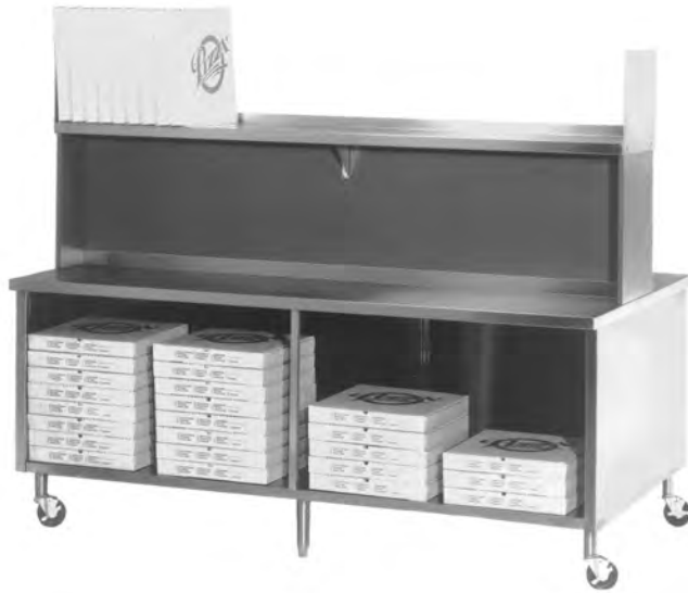
pizza cut-n-pack table

Eagle Pizza Cut-n-Pack Table, model _____. Heavy duty stainless steel construction with 16 gauge stainless steel top and open base storage. Laminate plastic divider panel with choice of colors, standard color is Formica 845 Spectrum Red. Mounted on casters.