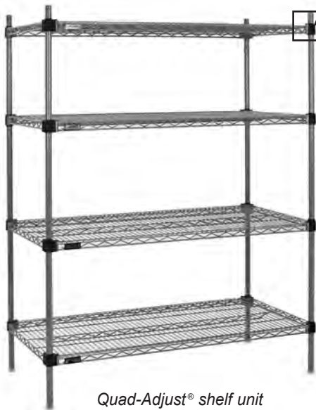
Quad-Adjust® shelf unit