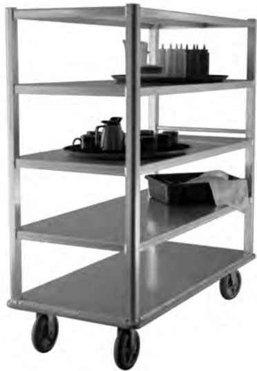
aluminum banquet cart

Eagle Banquet Cart, model _____. Available in aluminum (with all-welded aluminum construction), or stainless steel (with all-welded aluminum frame with stainless steel shelves). Handles and uprights with smooth radius. Features include two handles (one per end of unit), solid shelves with marine edge, perimeter bumper, and heavy duty 8" x 2" platform casters (two swivel, two rigid).