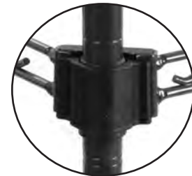
Quad-Adjust® Collar - allows the addition or removable of a shelf without having to disassemble the entire shelf unit.