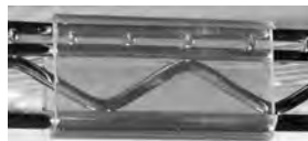
clear plastic label holder for reverse mat shelves