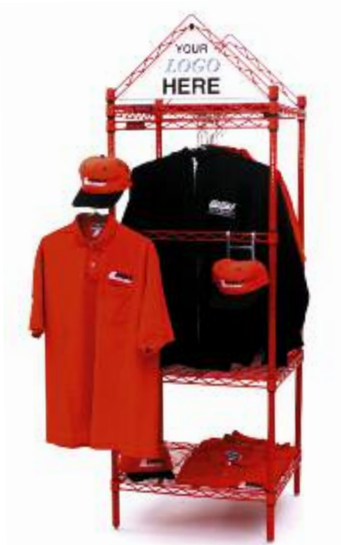
soft goods display shown with optional display hook