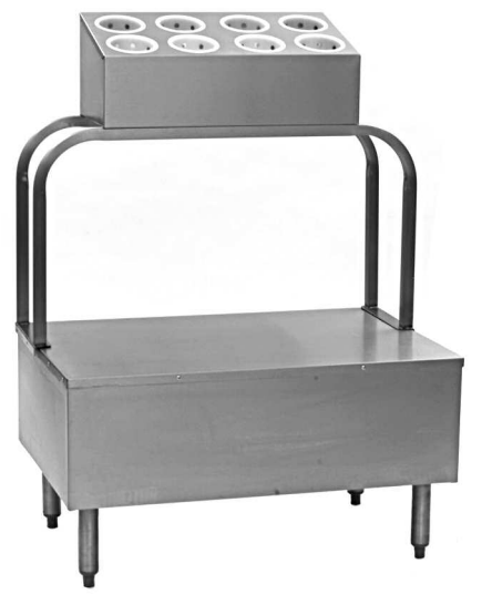
tray stand with optional silverware unit

Eagle Tray Stand, model TU-1. Top to be type 16/430 stainless steel with heavy gauge stainless steel cabinet base, 1% 0.D. stainless steel tubular legs and adjustable bullet feet.