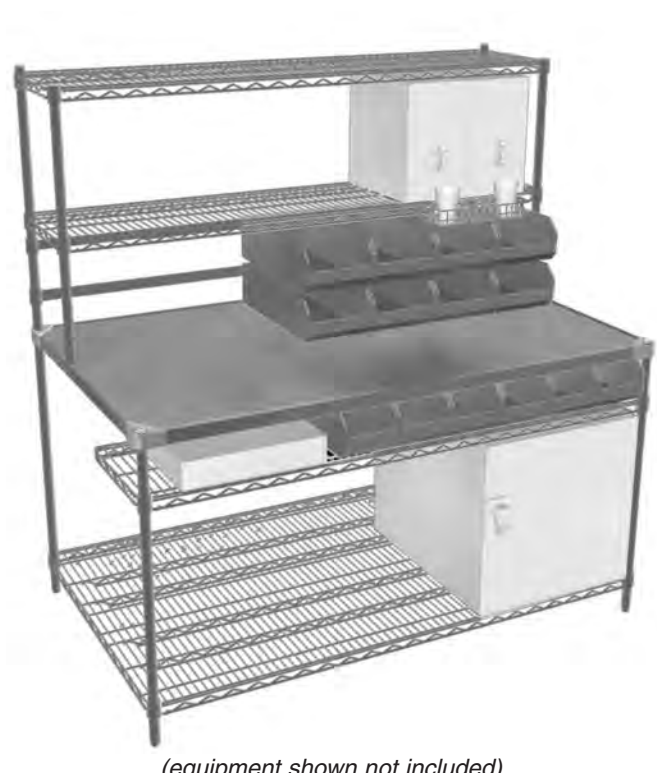
(equipment shown not included)