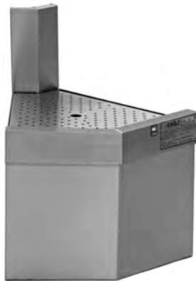
outer angle workboard