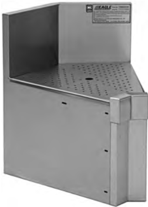
inner angle workboard

Eagle Spec-Bar® Angular Workboard, model _____. Heavy gauge type 304 stainless steel construction. Stainless steel removable perforated insert, drain and mounting clips.