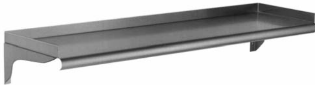
#WS1236-16/3 wall shelf

Eagle Wall Shelf, model _____. Constructed of 16 gauge type 430, 16 gauge type 304, or 14 gauge type 304 stainless steel. 1½" roll on front, with 1½" upturn on rear and ends. Stainless steel mounting brackets are stud welded to shelf.