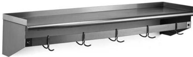
wall shelf with rack

Eagle Wall Shelf with Removable Hooks, model _____ . Shelf is constructed of 16 gauge type 304 stainless steel, with 1½" roll on front and 1½" upturn on rear and ends. 2" x ¾" type 304 stainless steel flat bar. Furnished with double-prong stainless steel removable hooks, one every 12".