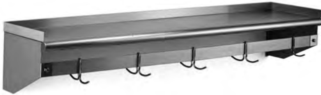
wall shelf with rack

Eagle Wall Shelf with Removable Hooks, model _____ . Shelf is constructed of 16 gauge type 430 stainless steel, with 1½" roll on front and 1½" upturn on rear and ends. 2" x ¾" type 304 stainless steel flat bar. Furnished with double-prong stainless steel removable hooks, one every 12".