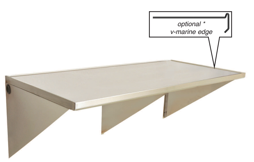
* See back page for more optional edges available.