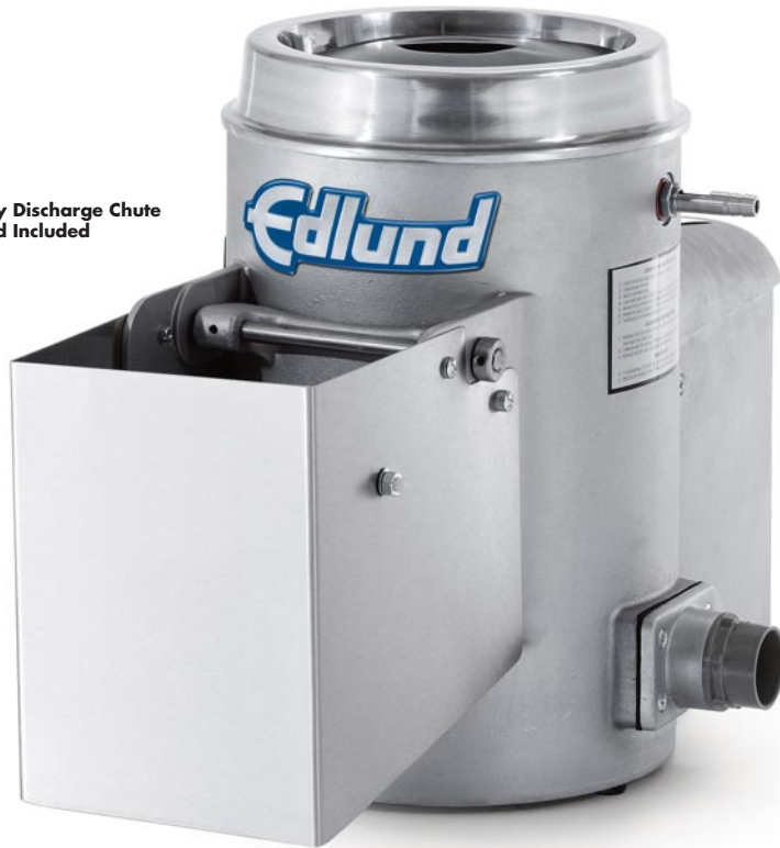
EPP-415 15 lb Potato and Vegetable Peeler