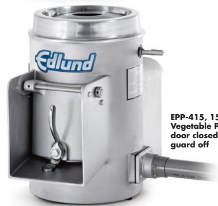
EPP-415, 15 lb Potato and Vegetable Peeler with chamber door closed and discharge chute guard off