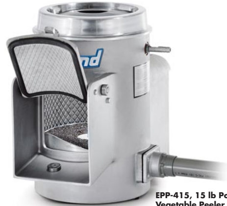
EPP-415, 15 lb Potato and Vegetable Peeler with chamber door opened