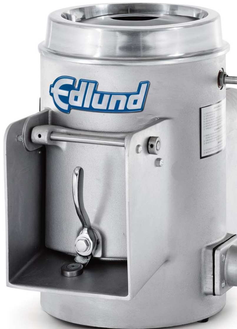
Model EPP-415 Shown

WASTE DISPOSAL. Included waste trap straining basket to separate peels from waste water.