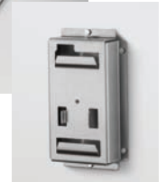
Quick disconnect wall mount bracket