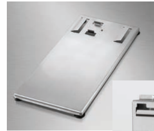
Suction Cup Table Base