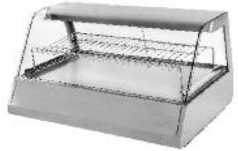
HOT 300 Shown: with standard stainless steel front panel