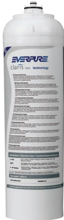
Clarix X-Large Cartridge: EV4339-13

Adjustable ion-selective filters to tailor carbonate hardness levels in potable water