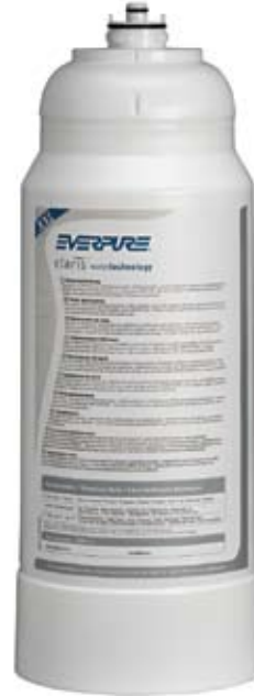
Claris XXL Filter Cartridge: EV4339-14

Everpure Claris water treatment systems are covered by a limited warranty against defects in material and workmanship for a period of one year after date of purchase. Everpure replaceable elements (filter cartridges and water treatment cartridges) are covered by a limited warranty against defects in material and workmanship for a period of one year after date of purchase. See printed warranty for details. Everpure will provide a copy of the warranty upon request.