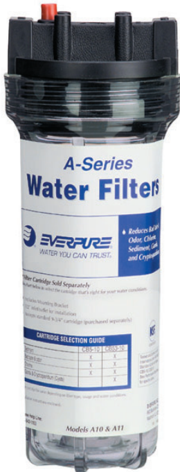
A-10 10" Clear Housing: EV9100-01