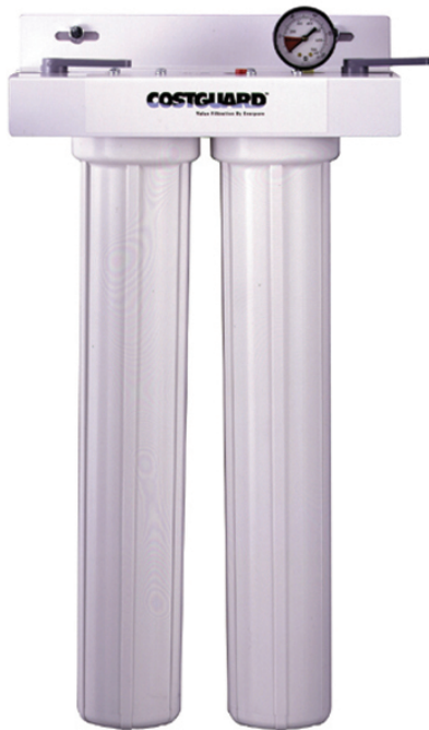
CGS-22 20" Dual Series Housing: DEV9100-22