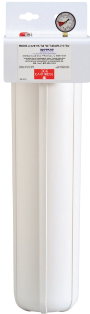
CB20-124E Housing: EV9100-31