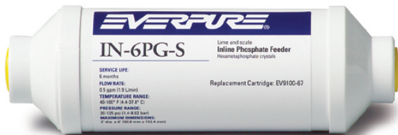
IN-6 PG-S: EV9100-67