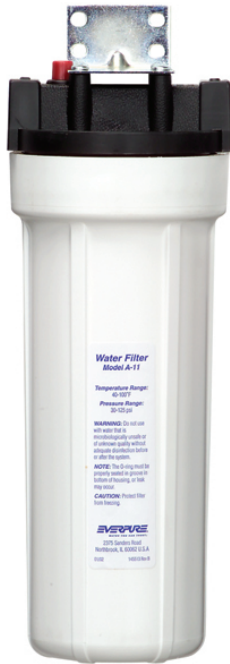
A-11 10" Opaque Housing: EV9100-02