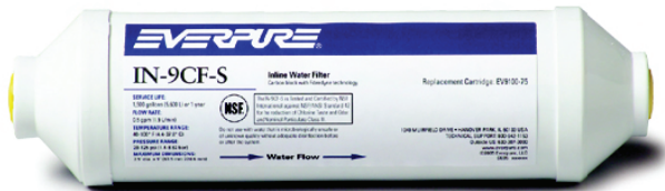
IN-9 CF-S: EV9100-75

Designed for great taste and odor reduction