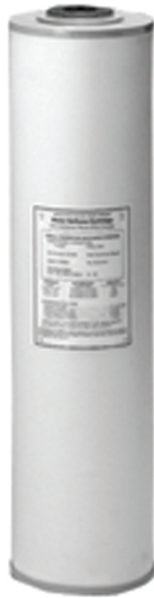
SO-10 Softening Cartridge: DEV9105-41