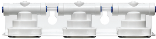
QCP Triple Head: EV9107-23

Filter head exclusively for Everpure QCP replacement cartridges