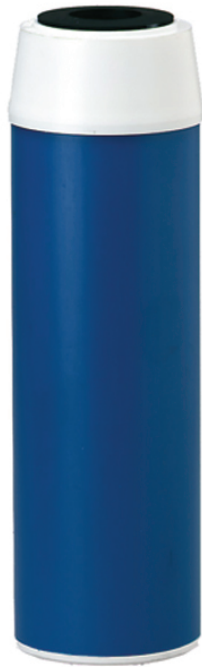
CGT-10S Replacement Cartridge: DEV9108-13