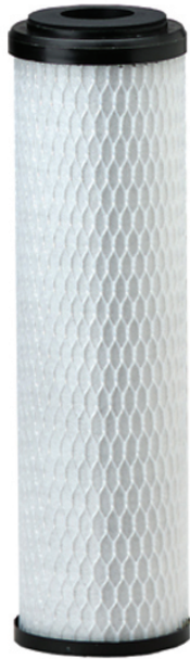
CG5-10 Replacement Cartridge: DEV9108-15