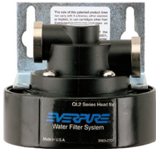
QL2 Single Head: EV9272-18

Filter head exclusively for Everpure replacement cartridges