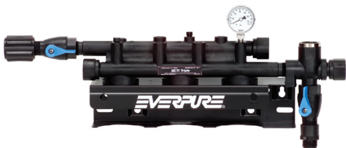
QC71 Triple Parallel Head: EV9272-23

Filter head exclusively for Everpure replacement cartridges