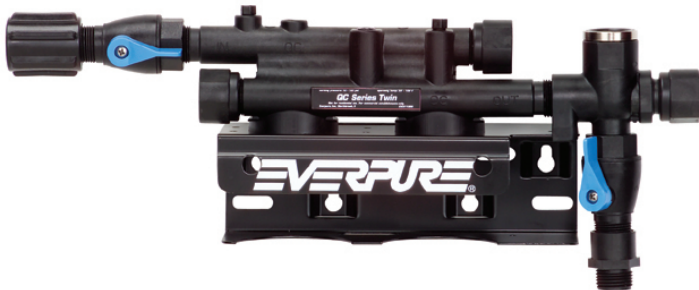
Twin Series Head: EV9272-24

Engineered for durability, strength and longevity. Will not corrode