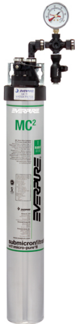
QC7I Single-MC 2 System: EV9275-01

Delivers premium quality water for fountain applications