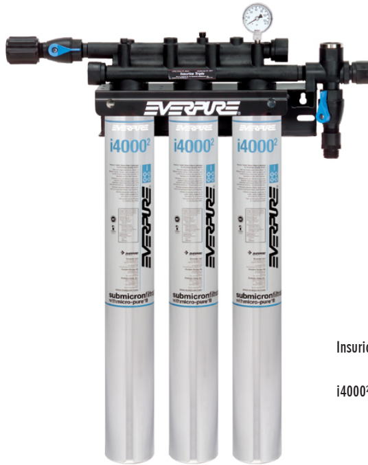
Insurice Triple-i4000 2 System: EV9325-03

Delivers premium quality water for ice applications